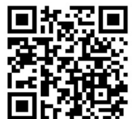
Utah Screwworm Suspect Report Form