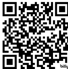
UDAF New World Screwworm Website

Email NVSL.parasitology@usda.gov and statevet@utah.gov with the tracking number and a photo or scan of the VS 5-38 Submission Form.