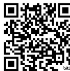
5-38 Parasite Submission Form