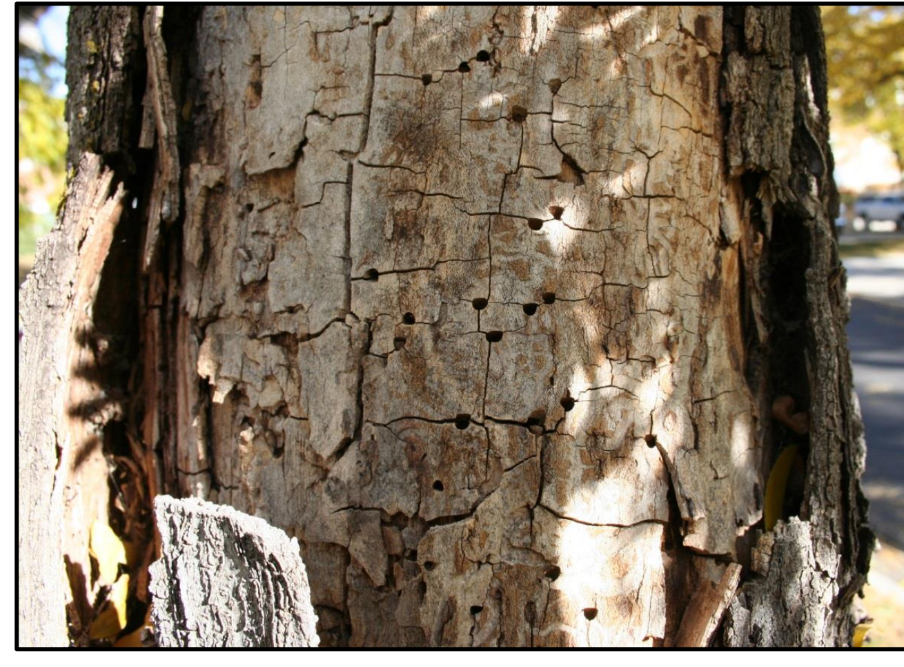
Figure 3: Emergence holes