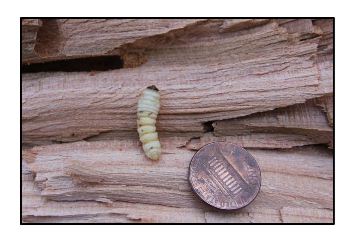
Figure 1: Larva Life Stage (Clint Burfitt, UDAF)

The adult is 11–20 mm long, with an elongated body and parallel-sided elytra (figure 2). The elytra, legs and other parts of the body vary in color from dark brown to brownish-orange, with the legs and antennae – usually being lighter –(figure 2). It is easily recognized by the irregularly distributed hairs on the elytra, which form spots (Kostin 1973). Mature larvae are 22 mm long, yellow-white in color, and have a brown head (Figure 1).