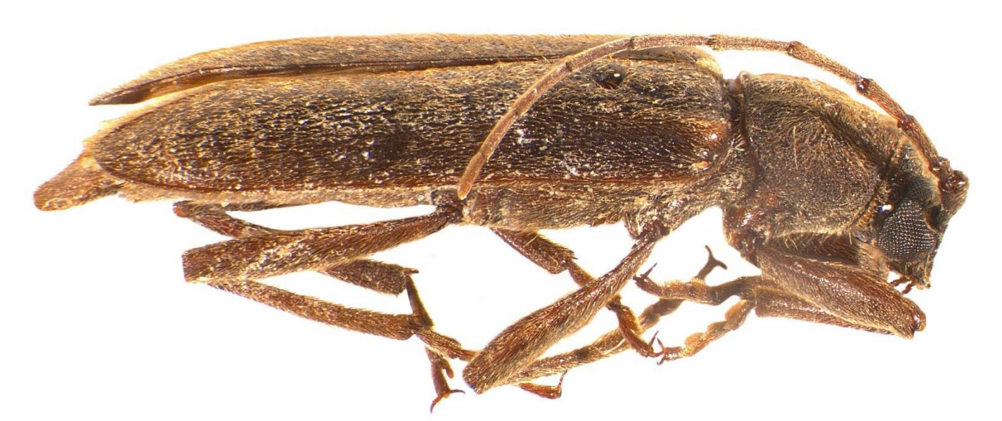
Figure 2: Adult Life Stage