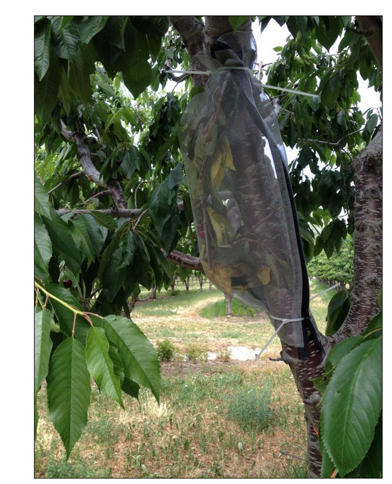
Figure 4: Sleeve trap made out of mesh wrapped around the branch of vulnerable fruit trees

Additionally, Otis laboratory has partnered with UDAF to develop a trapping method for T. campestris . Experimental trapping methods were implemented at 2 sites (table 3). Funnel traps of varying colors and lure types were placed at a site in Utah County. Cross vane panel traps were placed in a site in Salt Lake County. at varying distances from the ground. The results of this study are not yet available.