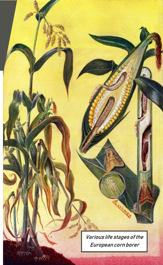
Various life stages of the European corn borer

QUARANTINED AREAS The following areas are designated as quarantined: Alabama, Arkansas, Colorado, Connecticut, Delaware, Georgia, Illinois, Iowa, Indiana, Kansas, Kentucky, Louisiana, Maine, Maryland, Massachusetts, Michigan, Minnesota, Mississippi, Missouri, Montana, Nebraska, New Hampshire, New Jersey, New York, North Carolina, North Dakota, Ohio, Oklahoma, Pennsylvania, Rhode Island, South Carolina, South Dakota, Tennessee, Vermont, Virginia, West Virginia, Wisconsin, Wyoming and the District of Columbia.