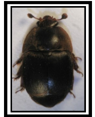
James D. Ellis, UFL

However one small hive beetle (SHB; pictured) was detected in Washington County; a delimiting inspection effort was implemented which determined that SHB was not established in the area. No other exotic pests were found.