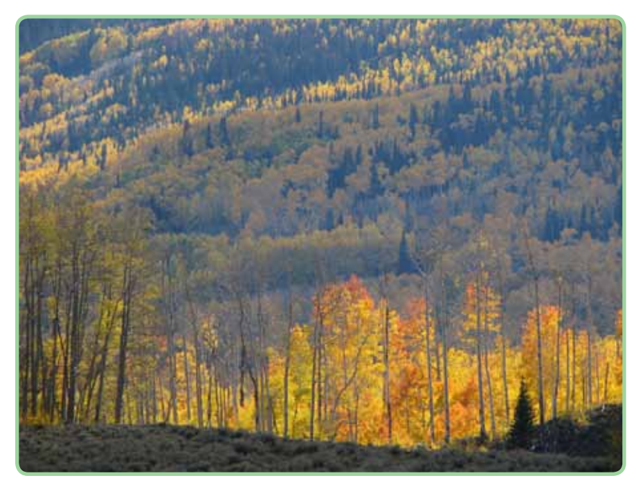
Aspen in fall

One option is to continue with current management. If an aspen site is exhibiting problematic conditions and the decision is to continue with current management, publicly articulate why such an approach is justifiable and the various consequences of the decision to make no response to the problematic condition(s).