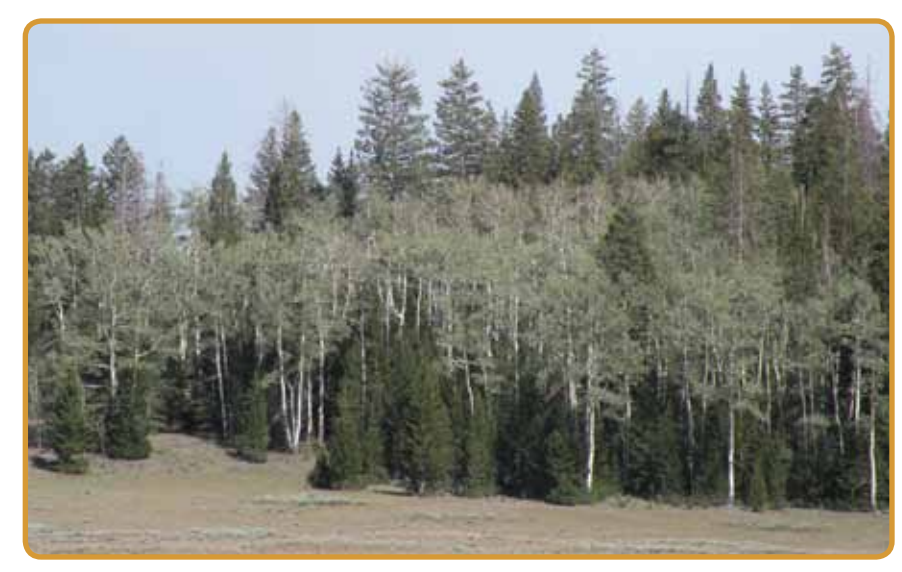
Conifers are overtopping aspen in this Fishlake National Forest stand

At the landscape scale, aspen declines are variable, depending on site characteristics, fire and succession, extreme climatic events, biotic agents, and human influence. For instance, much of the loss of aspen-dominated acreage is attributable to encroachment and overtopping by conifer. It