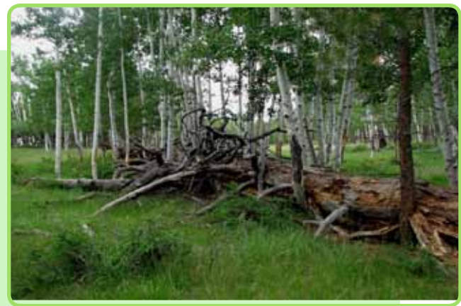
Aspen recruitment protected by a fallen log on the Manti-La Sal NF