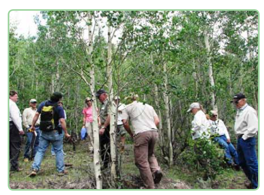
A 2-day Utah Forest Restoration Working Group field trip examined various Dixie NF aspen conditions