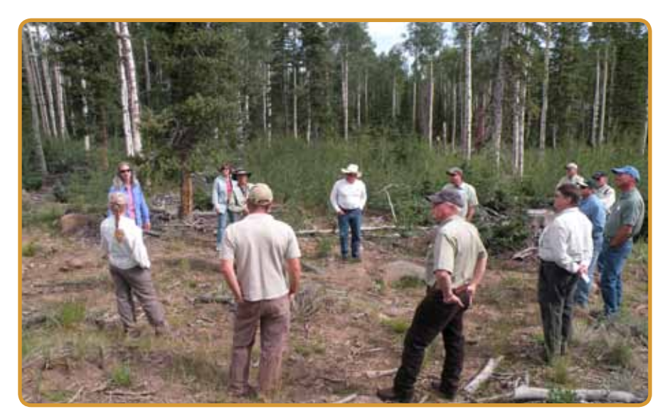
UFRWG members discuss aspen restoration at a clearfell site within the Dixie National Forest

In sum, no guidelines for aspen management can anticipate all situations. The intent here is to promote holistic thinking in management decisions. If we act before understanding either the larger ecological context or agents operating on aspen in specific sites, the probability of irrevocable damage increases. If we are uncertain of management outcomes, pre- and post- decision monitoring is critical. Documentation of restoration failures, as well as successes, is an important component of management.