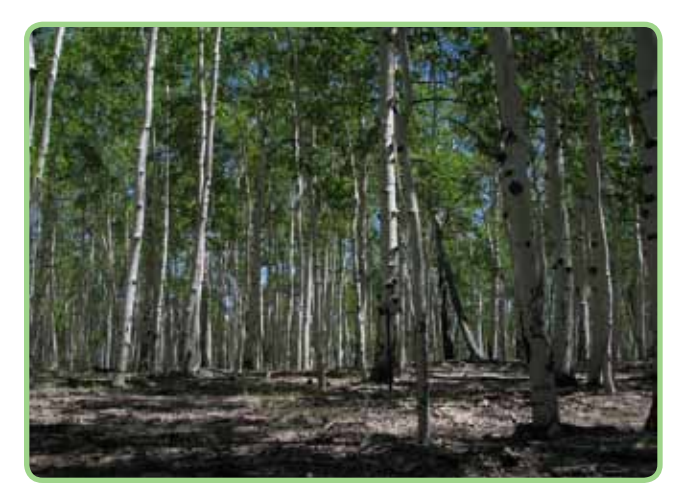
Aspen understory is lacking in this Parker Mountain stand

In addition, understory (forbs, grasses, and/or shrubs), a major source of aspen community diversity, may be depleted relative to potential. For instance, smooth brome ( Bromus inermis ), an exotic, perennial, rhi-