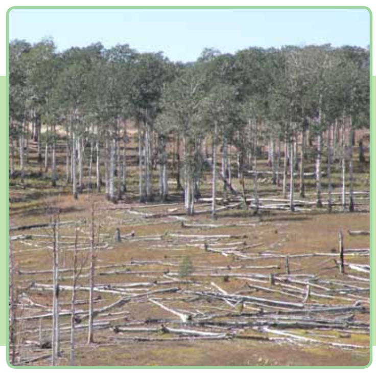
Drought, combined with wild and/or domestic ungulate browsing, may lead to weaker clones susceptible to disease and complete die-off (Cedar Mountain, Utah)

Appendix C provides some methods for data collection and monitoring that could be used as starting points to collect data to help identify underlying problematic conditions.