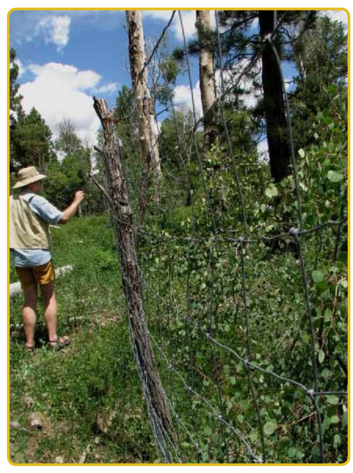
Aspen is recruiting locally only inside this ungulate exclosure on an allotment not grazed by livestock for 8 years (Manti-La Sal NF)

Thus, the varying parameters of reference sites (e.g., large areas inaccessible or closed to livestock, areas minimally or not used by wild ungulates, livestock exclosures, three-way exclosures, varying elevations and locations within Utah) can yield particular types of information relevant only to particular questions.