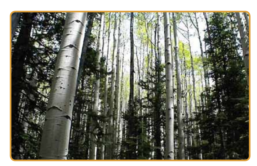
Upland aspen mixed with conifer