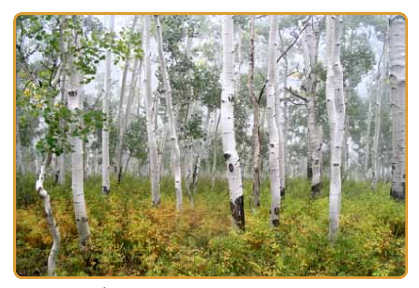
Pure aspen stand

Finally, these guidelines focus on restoration of aspen forests , but maintaining healthy aspen communities is of equal importance to restoration as a management focus.