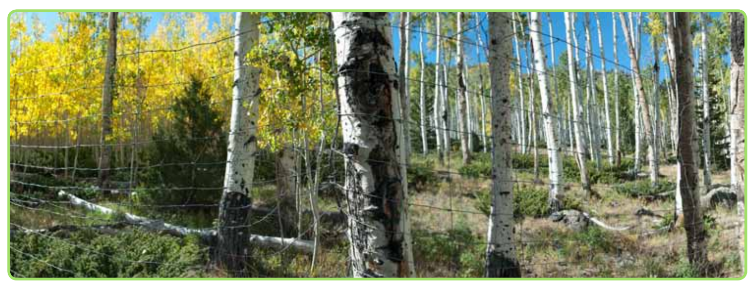
Two Pando clone exclosures with different aspen conditions. Left, clearcut and protected; right, enclosed but not successfully protected from deer

To make the most positive change on the trajectory of aspen in a watershed, multiple small stands may need to be considered together in time and space to maximize benefits to aspen across the landscape.