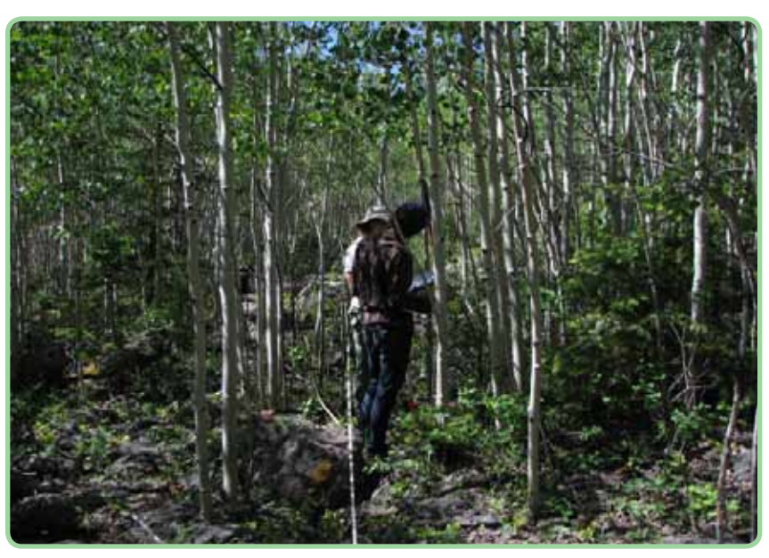
Six years after the Johnson Fire on Fishlake NF, this single-tier stand is 12'-18' tall