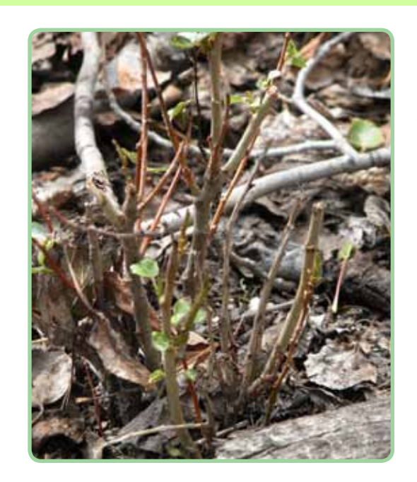
Aspen sprouts which are repeatedly browsed have multiple stems and a "bushy" appearance

Both regeneration and recruitment are important indicators of aspen stand conditions. The following chart outlines three levels of regeneration and one level of recruitment as per acre/hectare measures. If either regeneration (suckers) or recruitment (saplings/mid-story) are below 500/stems per acre, it is likely that a stand is not "self-replacing" (Mueggler 1989, Campbell & Bartos 2001, Kurzel et al. 2007, Rogers et al. 2010).