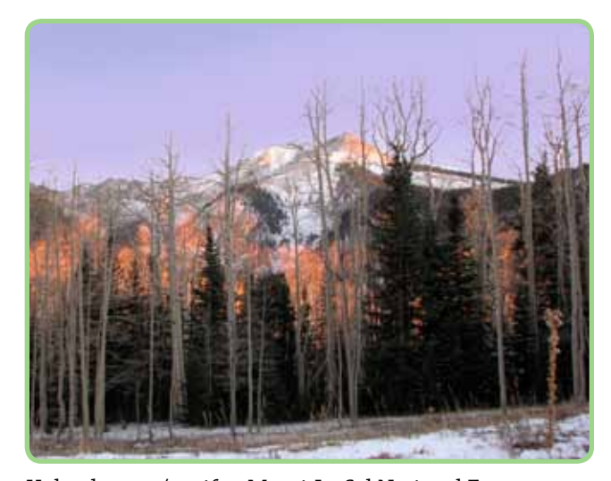
Upland aspen/conifer, Manti-La Sal National Forest

A problem may exist when an aspen stand is not recruiting suckers into the overstory for long-term maintenance of the stand, as an aspen stem generally does not live more than 150 years. Very low or nonexistent recruitment and regeneration is nearly always a cause for further investigation.