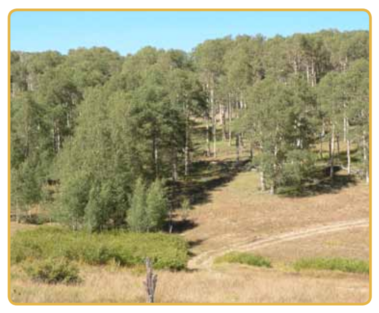
Even from a distance, differences in aspen stand health are evident where a green, multi-layered stand (left) contrasts with the less vibrant and open understory stand (right). A low fence divides these two segments

Establish a Forest Service website describing Forest/District-specific aspen restoration successes (and failures), including the actions that were taken associated with either the successes or failures at: