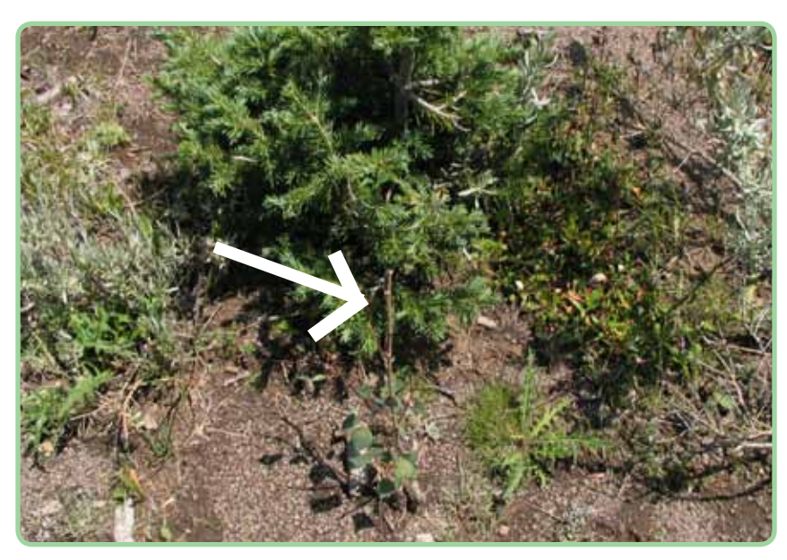
Conifer advantage: Browsed aspen sprout (arrow) next to unbrowsed conifer sprouts