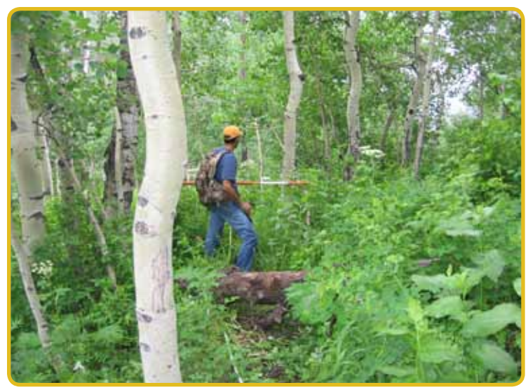
Measuring recruitment in the Butler Fork Research Natural Area near Salt Lake City provides one aspen reference area for northern Utah