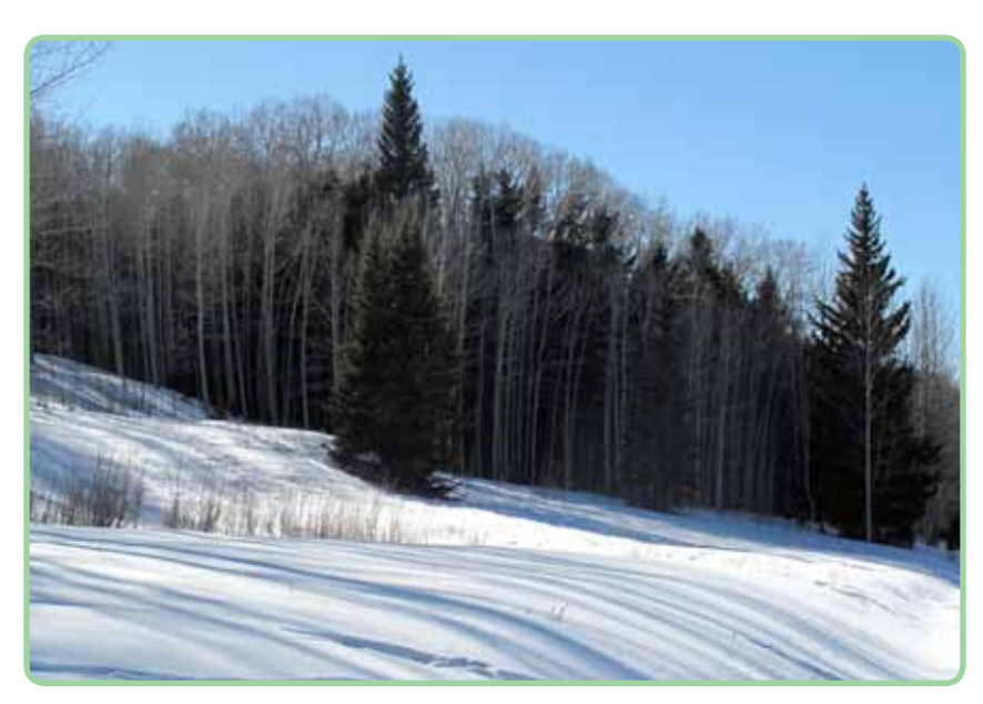
Aspen about to be overtopped by conifer, Manti-La Sal \operatorname{NF}