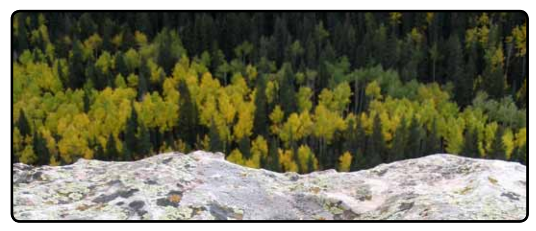
Riparian aspen overtopped by conifer, Brumley Creek, Utah