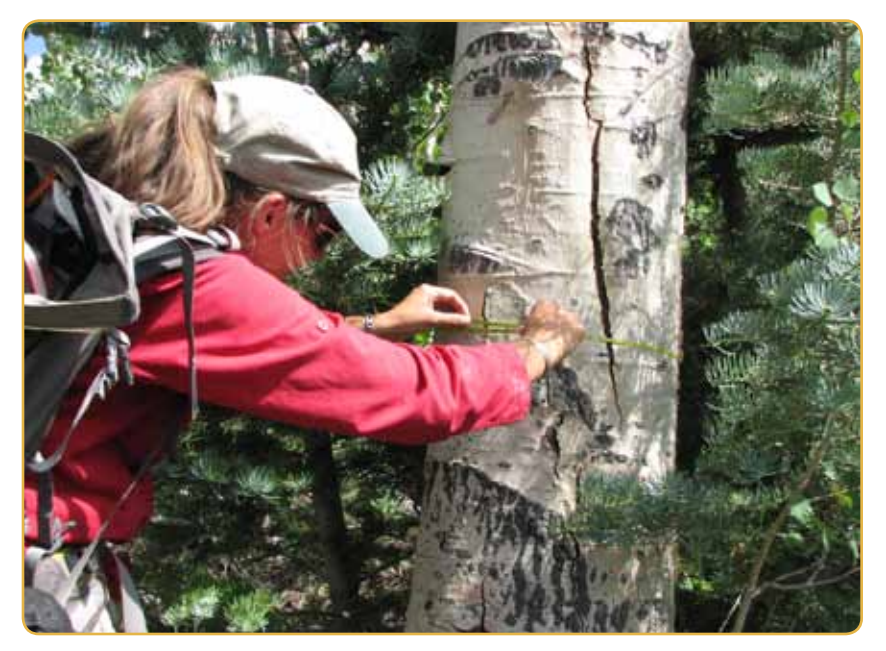
Monitoring the height/diameter structure of an aspen stand complements measures of browse intensity

The "best available science" is unlikely to predict site-specific responses to management actions with a high degree of accuracy. Monitoring improves our understanding of our "field trials" of aspen restoration.