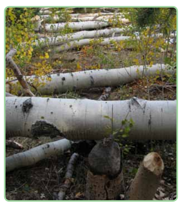
Aspen cut by beaver

While an aspen stand may die of disease, it may have been pre-disposed to disease by drought, human or animal activities within the stand (e.g. debarking; Hinds & Krebill 1975; DeByle 1985). Managers should endeavor to determine the relative significance of the stressors in areas of aspen decline.