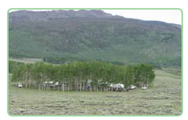
Dispersed camping in aspen stands can prevent stand regeneration