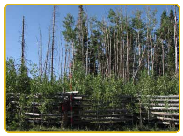
Grindstone Flat in the Tushar Mountains has been maintained as a three-way exclosure for more than 75 years and has been repeatedly studied