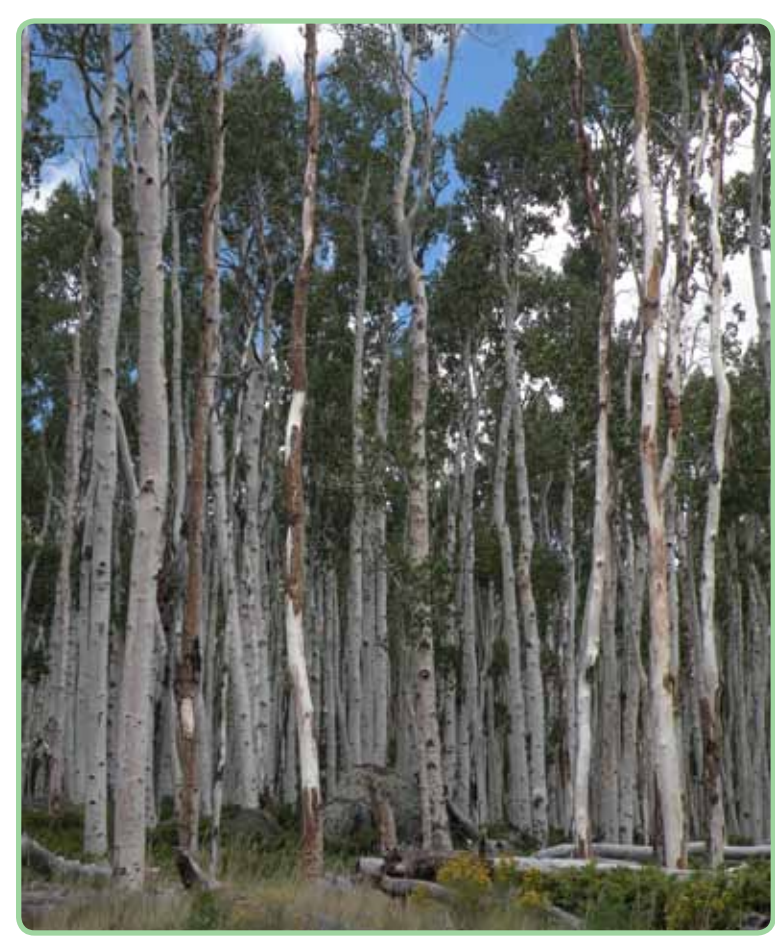
Portions of the 106-acre Pando clone on the Fishlake National Forest are undergoing 50-75% mortality in the autumn of 2010

These numbers should be considered as minimum indicators. There is some disagreement within the community of scientists that study aspen what the exact numbers may be; however, the numbers described by Bartos and Campbell (1998) are a reasonable starting point that could be adjusted based on site specific data.