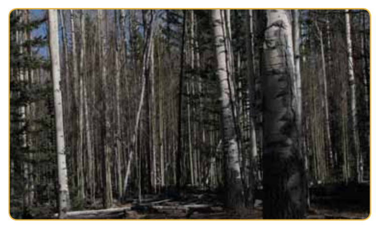
Dense aspen recruitment in a conifer opening on the Dixie NF